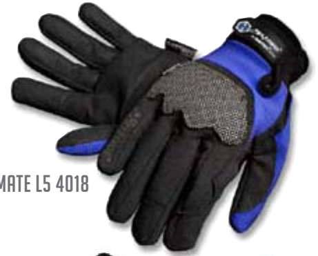
ULTIMATE L5 4018