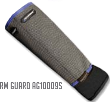
9" ARM GUARD AG10009S