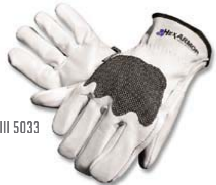
STEELLEATHER™ III 5033