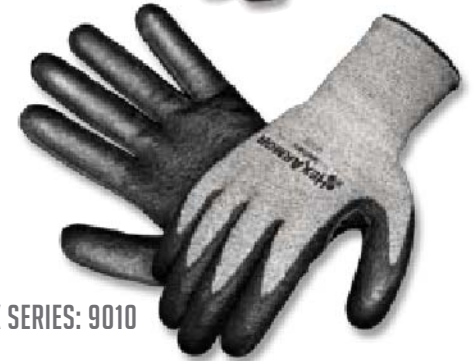
LEVEL SIX SERIES: 9010